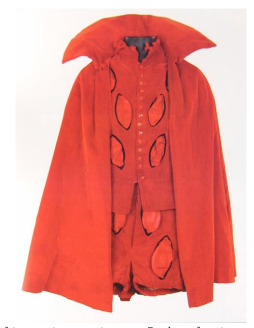
Alternate costume. Red velvet doublet and shorts with almond-shaped motifs of red puffed fabric. Velvet stand-collar cape. United Costumers label has handwritten in black ink "Lon Chaney".